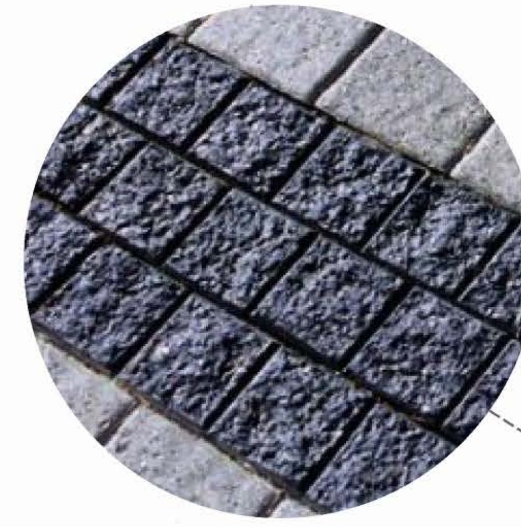
Unigranite by Unilock precast pavers