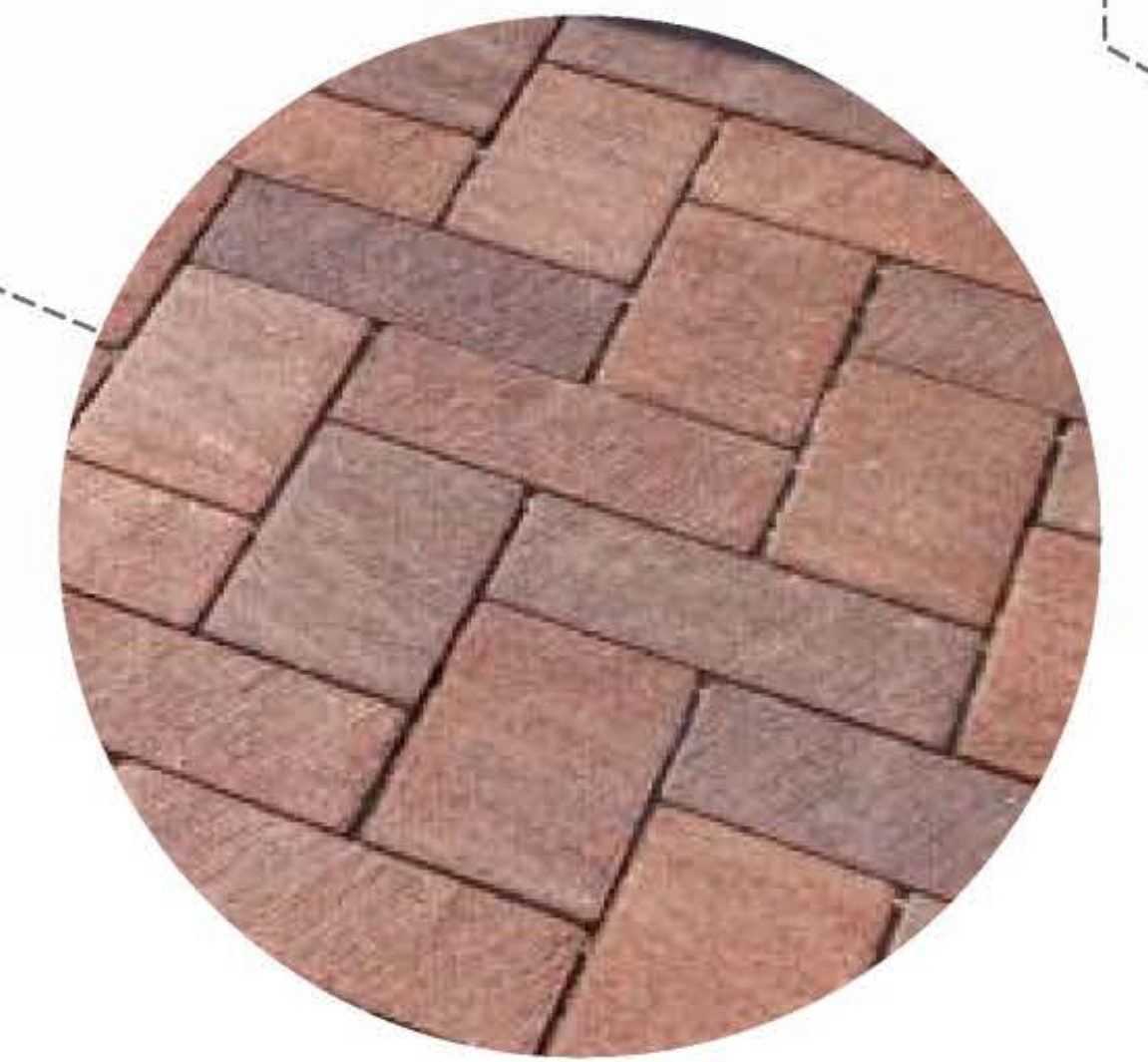
Il-Campo by Unilock precast pavers